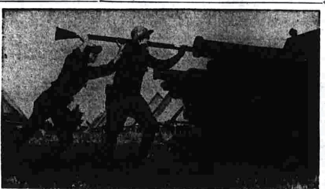
Two soldiers swab out a howitzer in the Army maneuvers at Plattsburg, N. Y., where 3,000 officers heard Lt. Gen. Hugh A. Drum describe as "woefully short in manpower and weapons" the force assembled for the war games. The First Army, massed for the maneuvers, is a collection of partially equipped units, Drum said, and "not in fact an Army."